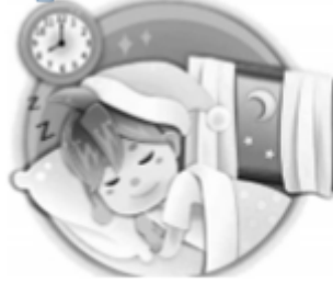
47. go to bed, every day