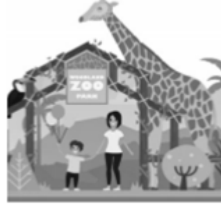
50. enjoy oneself , two days ago