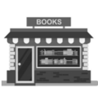
49. next to